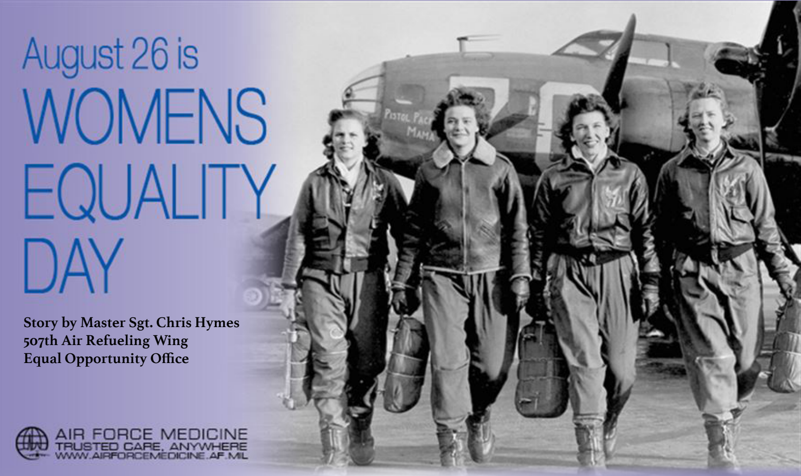
(U.S. Air Force graphic by Steve Thompson)

omen's Equlity Day is celebrated in the United States on August 26 to commemorate the 1920 adoption of the 19th Amendment to the United States' Constitution.